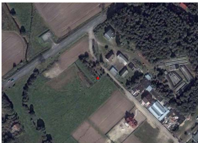
Figure 1. Tested point location.

This section presents a general overview of the test site including measurements and employed model description.